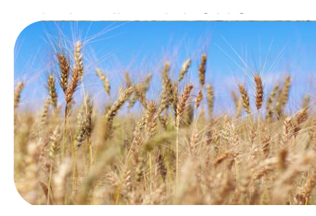
Whoever watches the wind will not plant; whoever looks at the clouds will not reap. (Ecclesiastes 11:4)

It the promise is something that you can easily afford, it requires little or no faith. If the promise isn't a challenge, it may not stretch your faith. Our faith should be continually growing. Is yours?