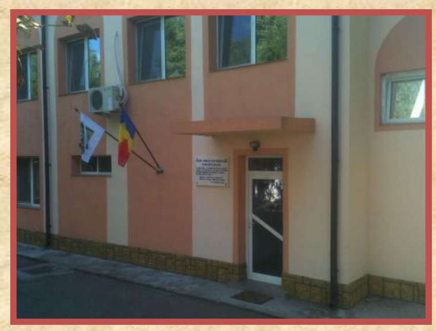
The Romanian Centre of Cross-Cultural Studies (CRST), a missions training school

The second year focuses on students' preparation for cross-cultural missions and orientation toward specific missions fields. (Graduates of other Bible schools may apply directly for the second year.) This year's courses are specifically about missions, with an emphasis on the essential Christian message in context. Among the courses offered in