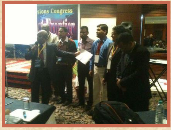
The Missions Committee being presented

This (congress) is the first of its kind for many of our leaders, who have never had an opportunity to be a part of such a meeting. Though it was a high-content-oriented congress with back-to-back sessions from 5 a.m. till 9 p.m., all the attendees gave full support and cooperation to me and expected to receive something new every time by attending all the sessions.