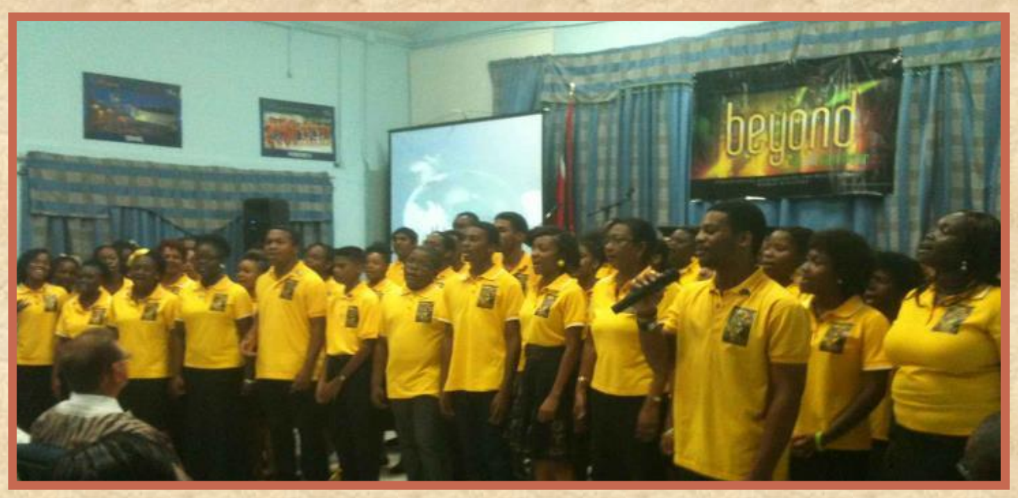
A 100-voice choir from four churches was a highlight of the convention