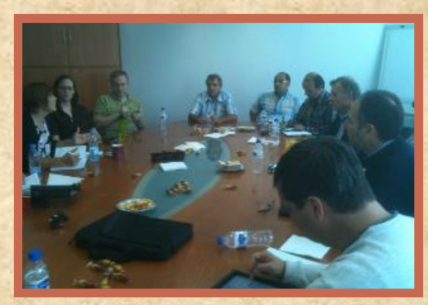
Part of the group meeting September 20, 2013