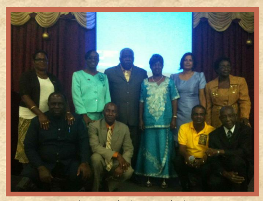
Pastors and spouses who organized and participated in this year's event