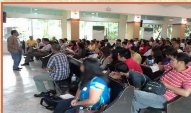
District Missions Event

Friends, the mission field is ready and they are definitely waiting just for us!