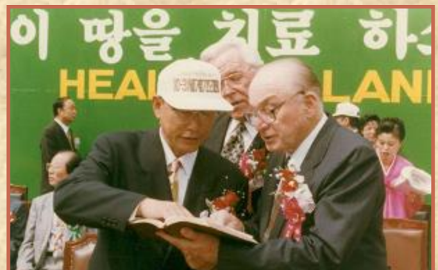
Dr. David Yonggi Cho with Dr. J. Philip Hogan

May this not only be true of the U.S. Assemblies of God and AGWM but of the entire WAGF and its autonomous national churches. Truly the wind of the Spirit has raised up workers (see the June 2015 bulletin), is giving us a vision for the world (September 2015 bulletin), and will be instrumental in the next 25 years of the WAGF being greater than the first 25! The vision for the WAGF was birthed in a prayer retreat of a major missions-sending structure. May that continue to be a defining part of our purpose and vision as we move forward!