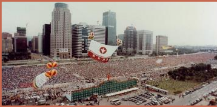
Overview of First WAGF Congress, 1994, Seoul, S. Korea

In a sense, Hogan moved Springfield from being a de facto and informal “world headquarters” to become the means by which someone from Africa, for example, could communicate with someone from Asia. It opened up a brand new day. Observably, Hogan, without knowing it, was getting ahead of the Internet and the future global communication revolution that would change many of these dynamics anyway.