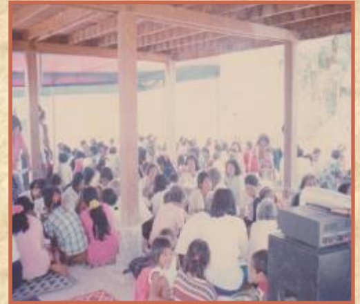
Believers of a pioneer church

If I close my eyes, I can see it to be apt for Filipino missionaries in villages, towns or cities where the gospel has never been preached. I can see them live in places they will call home. Eat with persons they will call family. Play with the people's children they will call their own. Pray with them, cry with them, and worship the Lord with them, love them until God brings them all to their heavenly home.